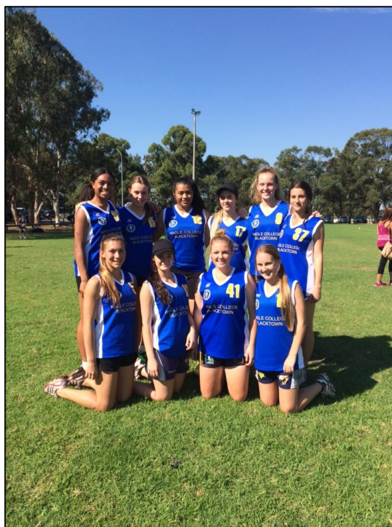
Open Touch Football Squad