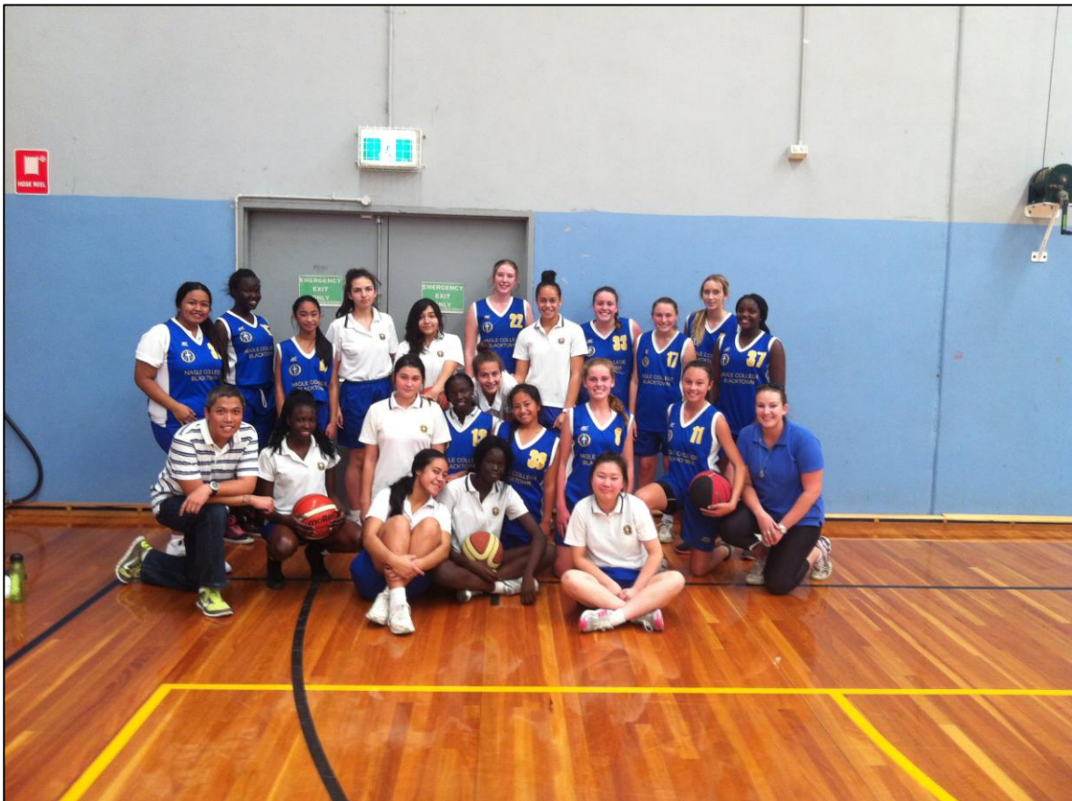
U/15 and Open Basketball Team