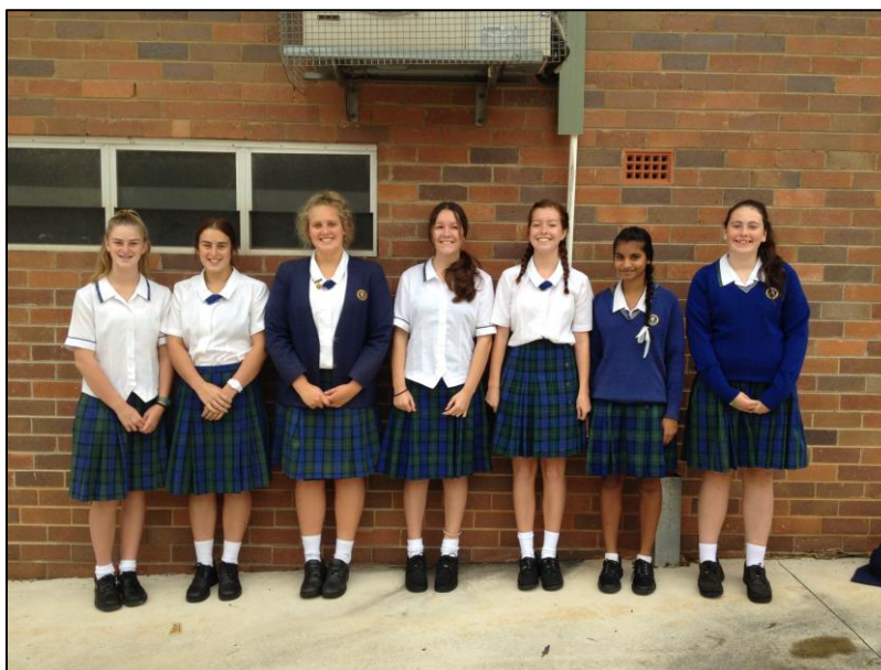
PDSSSC Swim Team