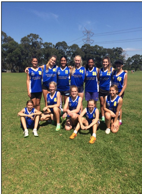
U/15 Touch Football Squad