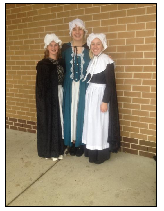
58A Orwell Street Blacktown, NSW 2148